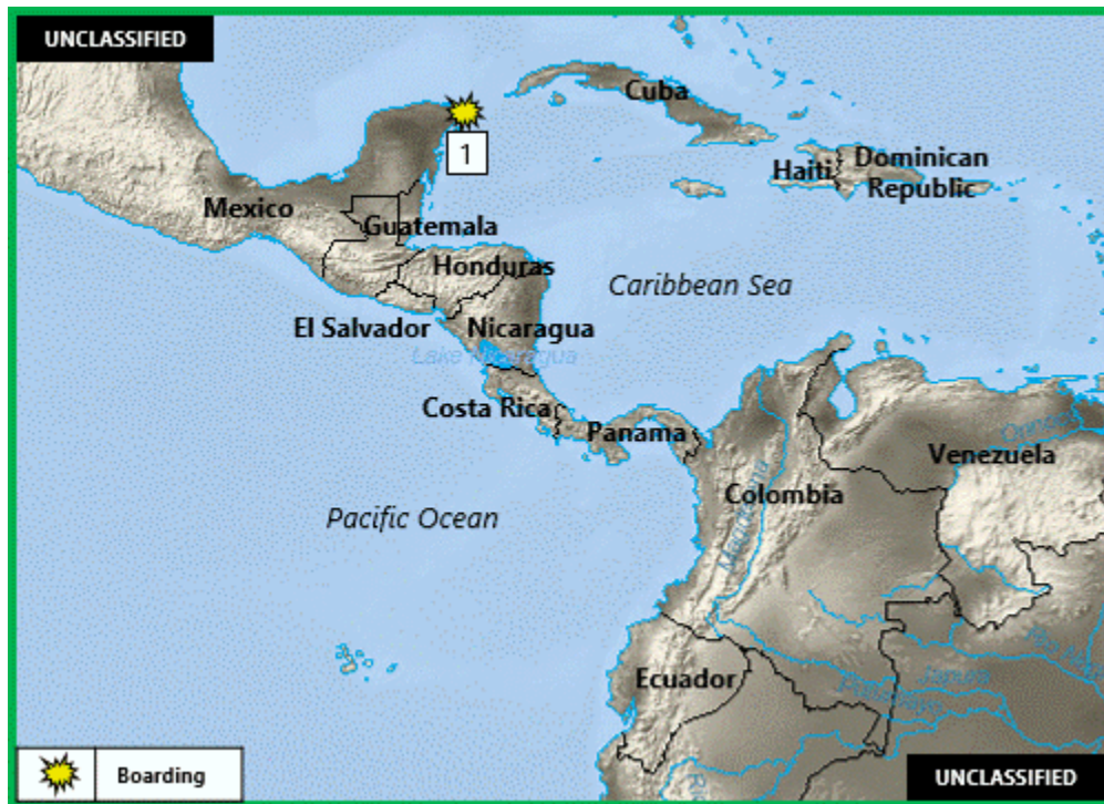
Figure 1. North America Piracy and Maritime Crime