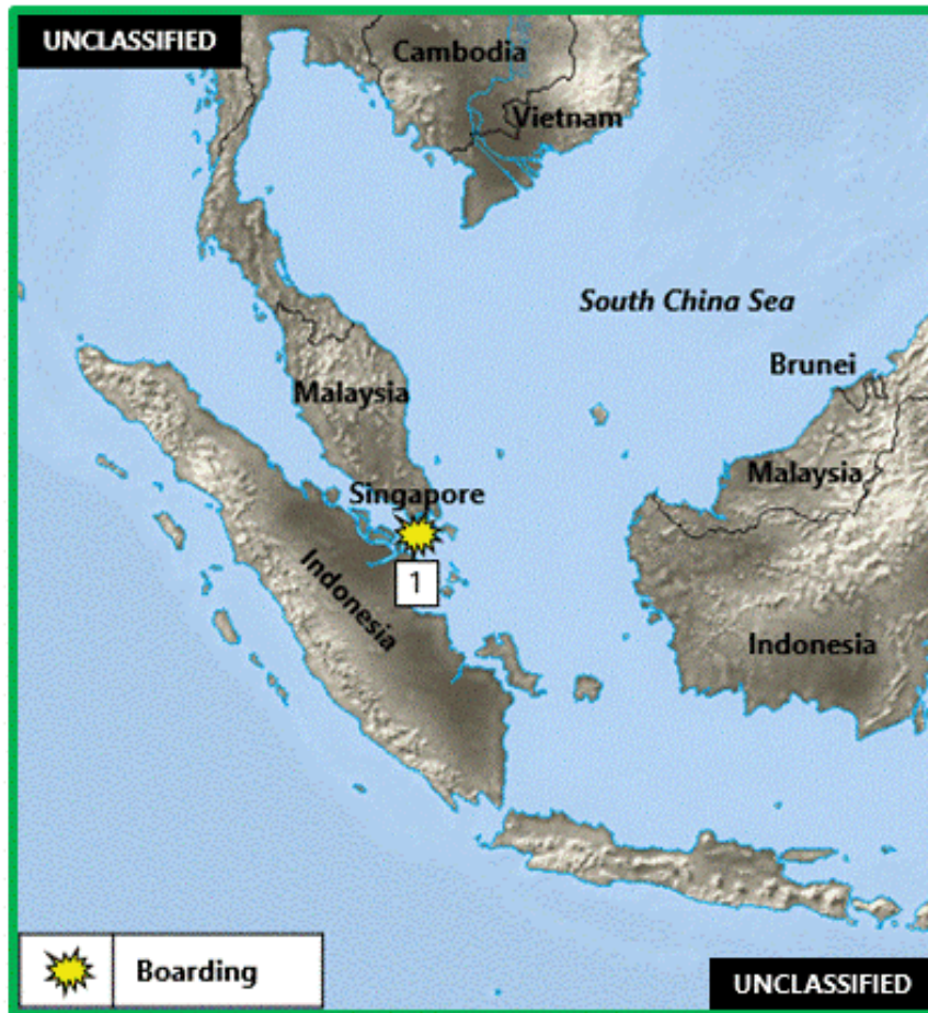
Figure 5. East Asia – Southeast Asia Piracy and Maritime Crime

1. (U) MALAYSIA: On 13 September at 0415 LT, four robbers armed with knives boarded a tanker underway approximately 3 NM southwest of Johor, near position 01:15N – 103:23E. A duty crewman spotted the robbers trying to enter the engine room. The alarm was raised, the crew was mustered, and all deck lights turned on. Upon seeing the alerted crew, the robbers escaped empty-handed into a waiting boat with two other perpetrators. (IMB; Clearwater Dynamics)