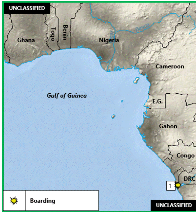
Figure 4. West Africa Piracy and Maritime Crime

1. (U) D.R. CONGO: On 14 September, robbers boarded a cargo ship anchored at Banana Anchorage, near position 05:59S – 012:24E. The robbers managed to board the vessel and steal ship's stores without being spotted. (Clearwater Dynamics)