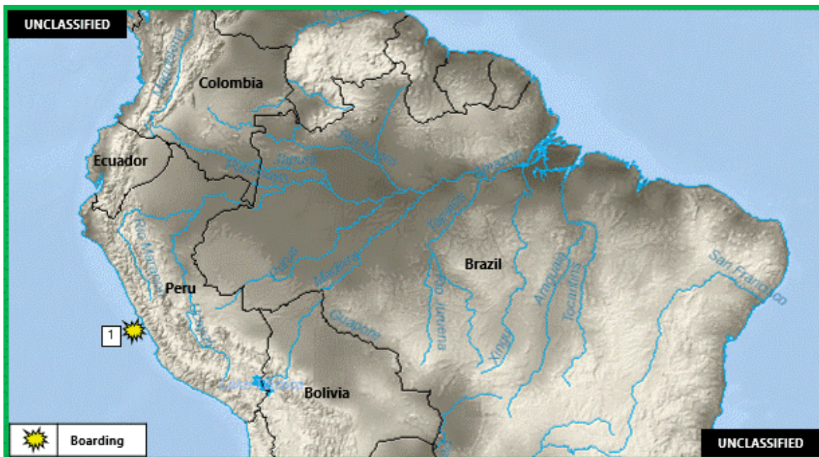
Figure 2. Central America – Caribbean – South America Piracy and Maritime Crime

1. (U) PERU: On 13 September, robbers boarded a container ship while anchored at Callao Anchorage, near position 12:01S – 077:11W. The robbers were able to board the vessel, steal ship's stores and escape unnoticed. The robbery was discovered by duty crew on routine rounds. (IMB; Clearwater Dynamics)